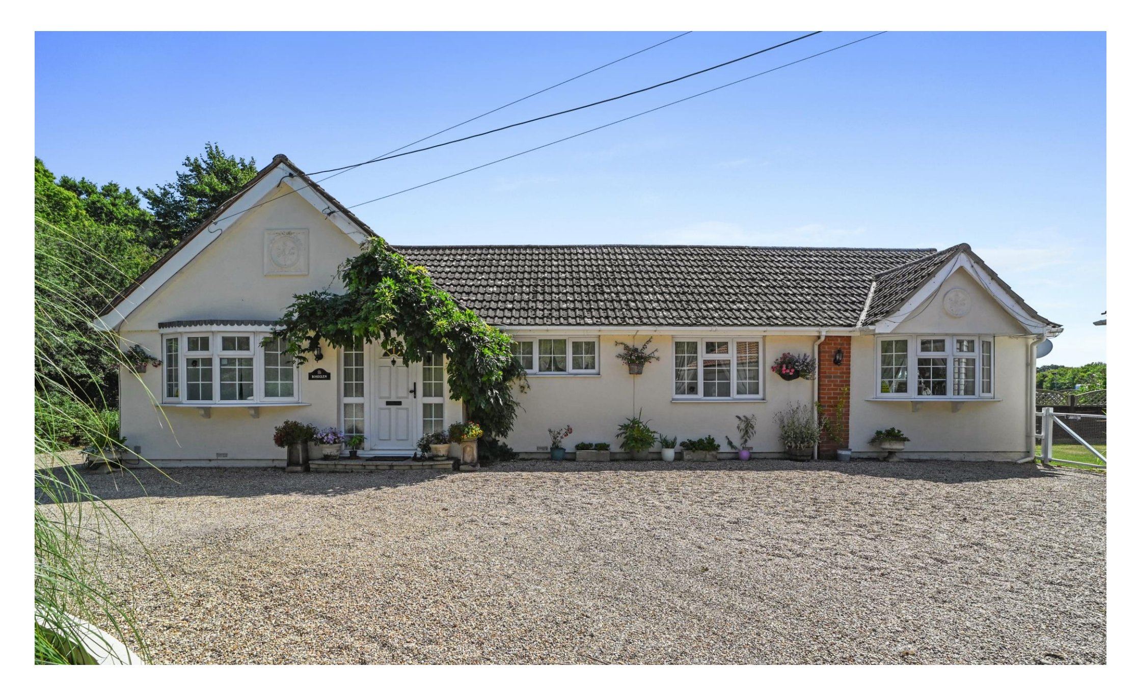
Rectory Road | Weeley Heath | CO16 9BH