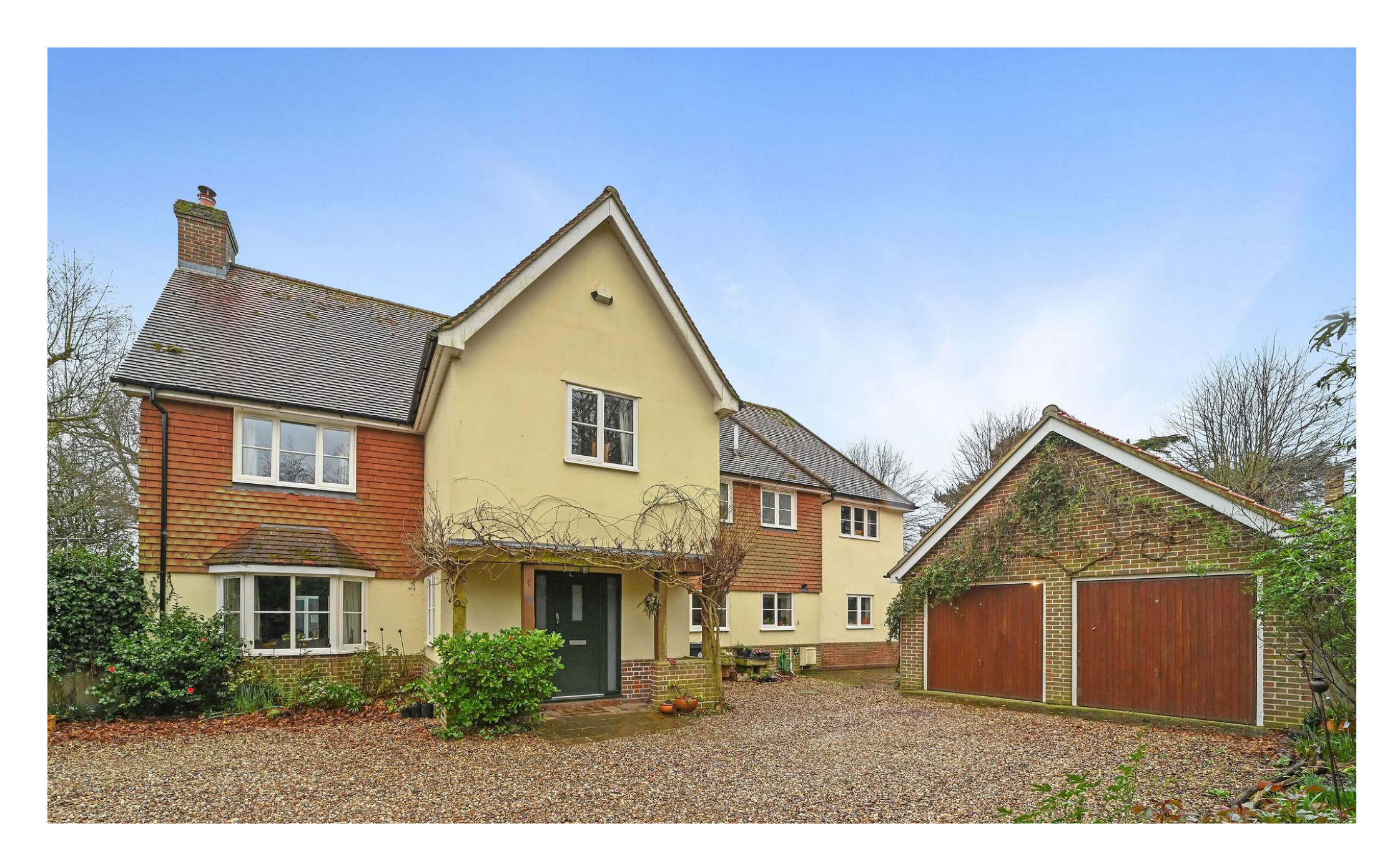
2 The Limes Harwich Road | Ardleigh | CO7 7RW