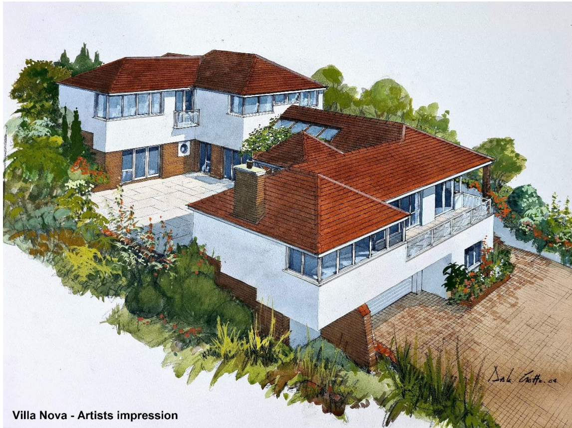
Villa Nova - Artists impression

The accommodation extends to over 4600 square feet with the principal rooms at the entrance level and arranged around and opening onto a wonderful west-facing Mediterranean-style courtyard which, along with the front balcony and outside spaces, provide a fabulous sense of inside/outside living. The entrance level accommodation includes a large lobby, reception room, atrium, dining room, bespoke kitchen, study, utility room, cloakroom, and large master bedroom with ensuite, thus easily providing the possibility of single level living. On the ground floor level there is a further double bedroom with ensuite and stair or lift access to the entrance level. On the first-floor level there are 3 further double bedrooms, all with en suite bathrooms. The enviable widespread views across the sea and coastline of Torbay are enjoyed from the majority of the rooms, with access to the landscaped gardens from the rear bedrooms. Outside there are electronic gates leading to a substantial driveway providing space for several vehicles and a motorhome/boat, along with a large double garage.