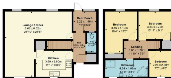
10, Alder Grove, Lytham St Annes, FY8 4LA

John Arden & Company for themselves and their clients declare that they have exercised all due diligence in the preparation of these details but can give no guarantee as to their veracity or correctness. Any electrical or other appliances included have not been tested, neither have drains, heating, plumbing and electrical installations. All purchasers are recommended to carry out their own investigations before contract. Details Prepared November 2024