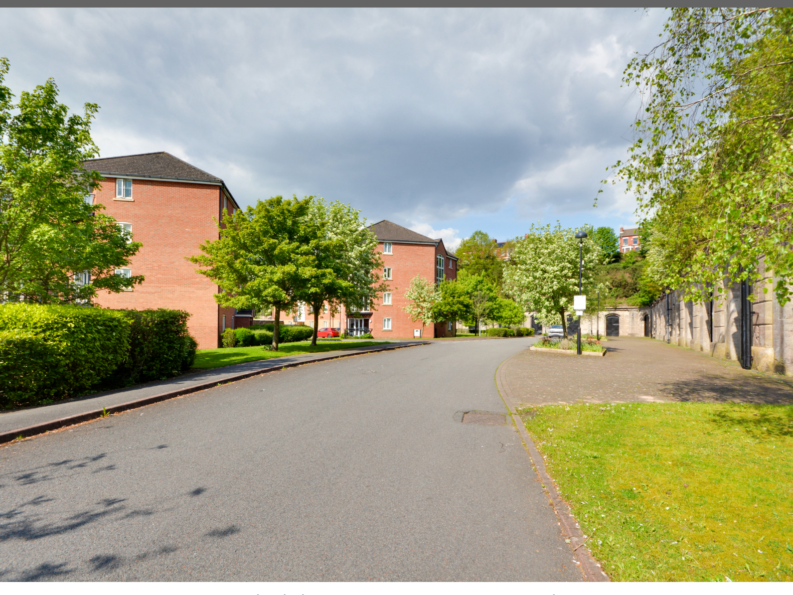
* Third Floor City Quay Apartment For Sale* No Chain * Two bedrooms * Balcony with fountain views * 0.1M From Otterspool Promenade * Allocated Parking Space