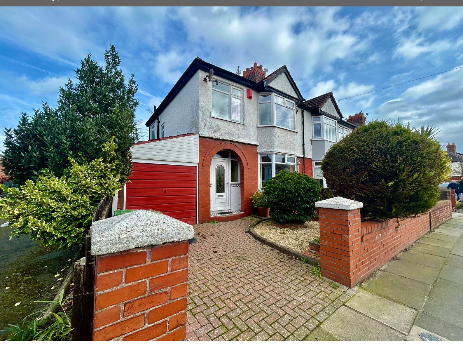
*Three Bedroom Semi-Detached House *Requires Updating & Modernisation *Central Heating & Double Glazing *Attached Garage *Gardens *Offers Potential to Update/Extend Subject to Necessary Permissions