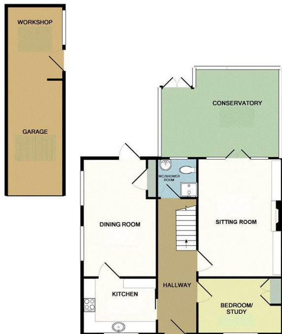
GROUND FLOOR APPROX. FLOOR AREA 1182 SQ.FT. (109.8 SQ.M.)