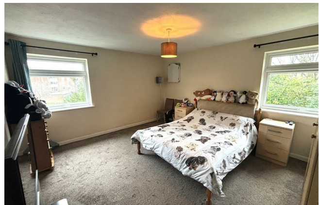
Ellera Court, Ash Vale, Aldershot