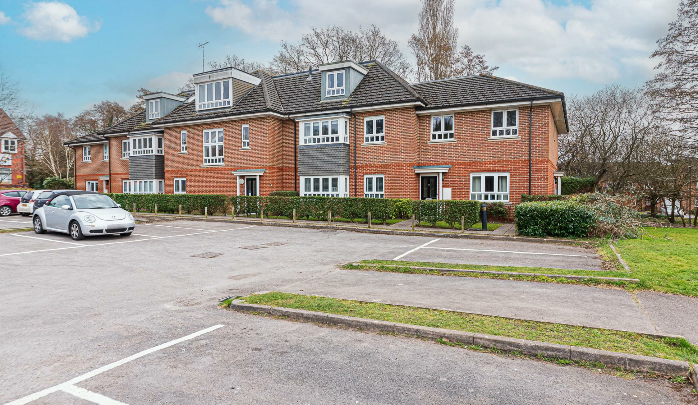
Doveton House Balmoral Drive, Frimley, Camberley