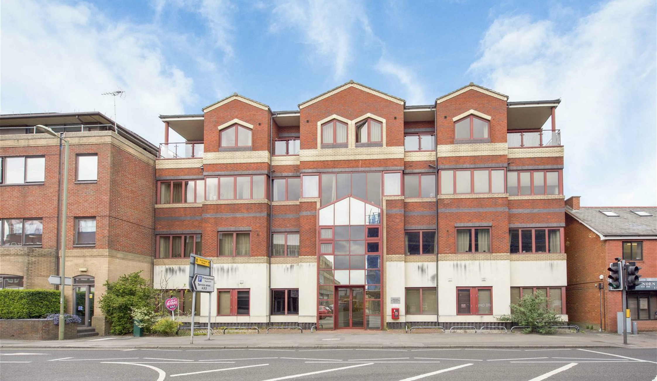
York House, Victoria Road, Farnborough