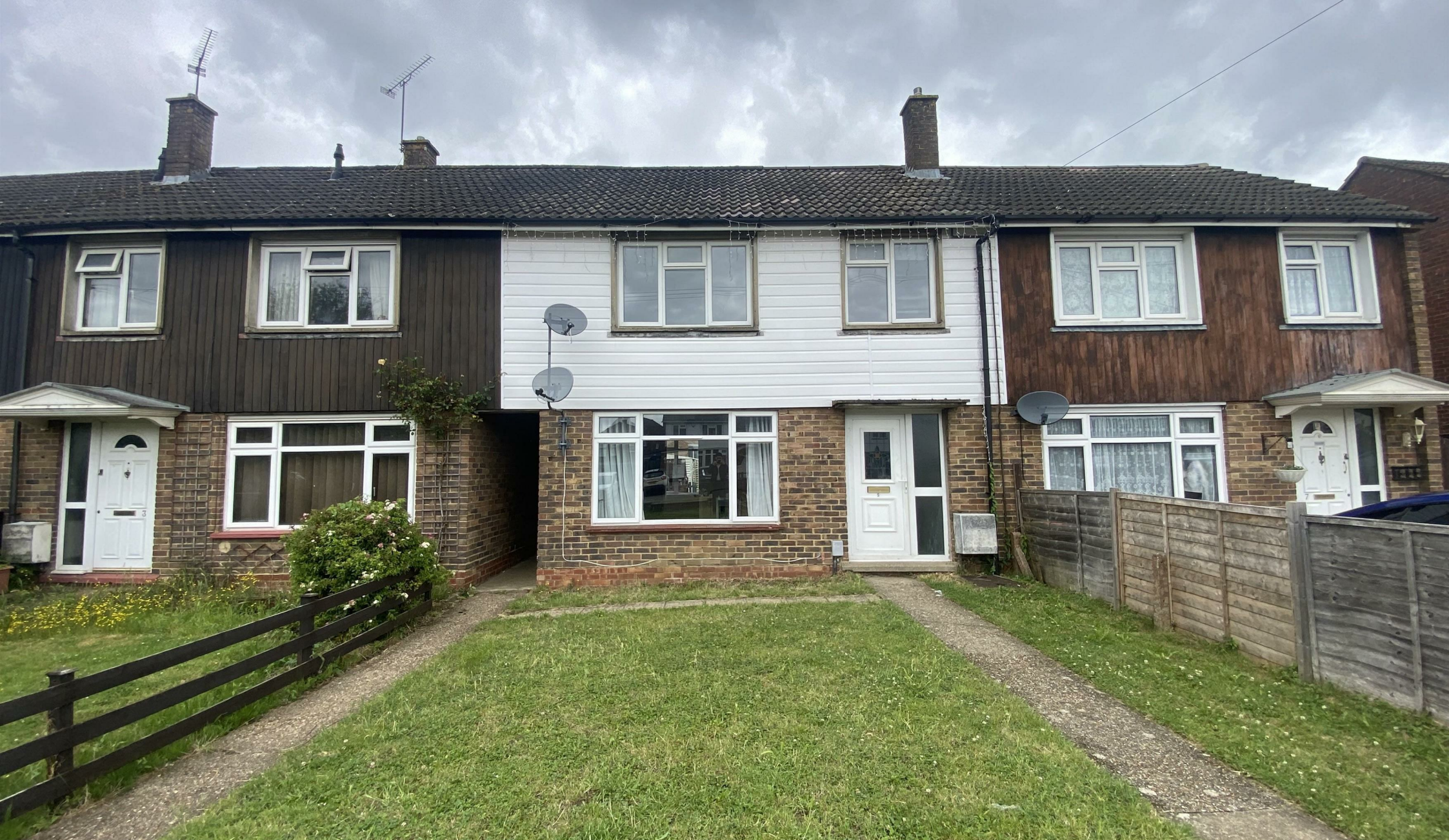
Cedar Close, Aldershot