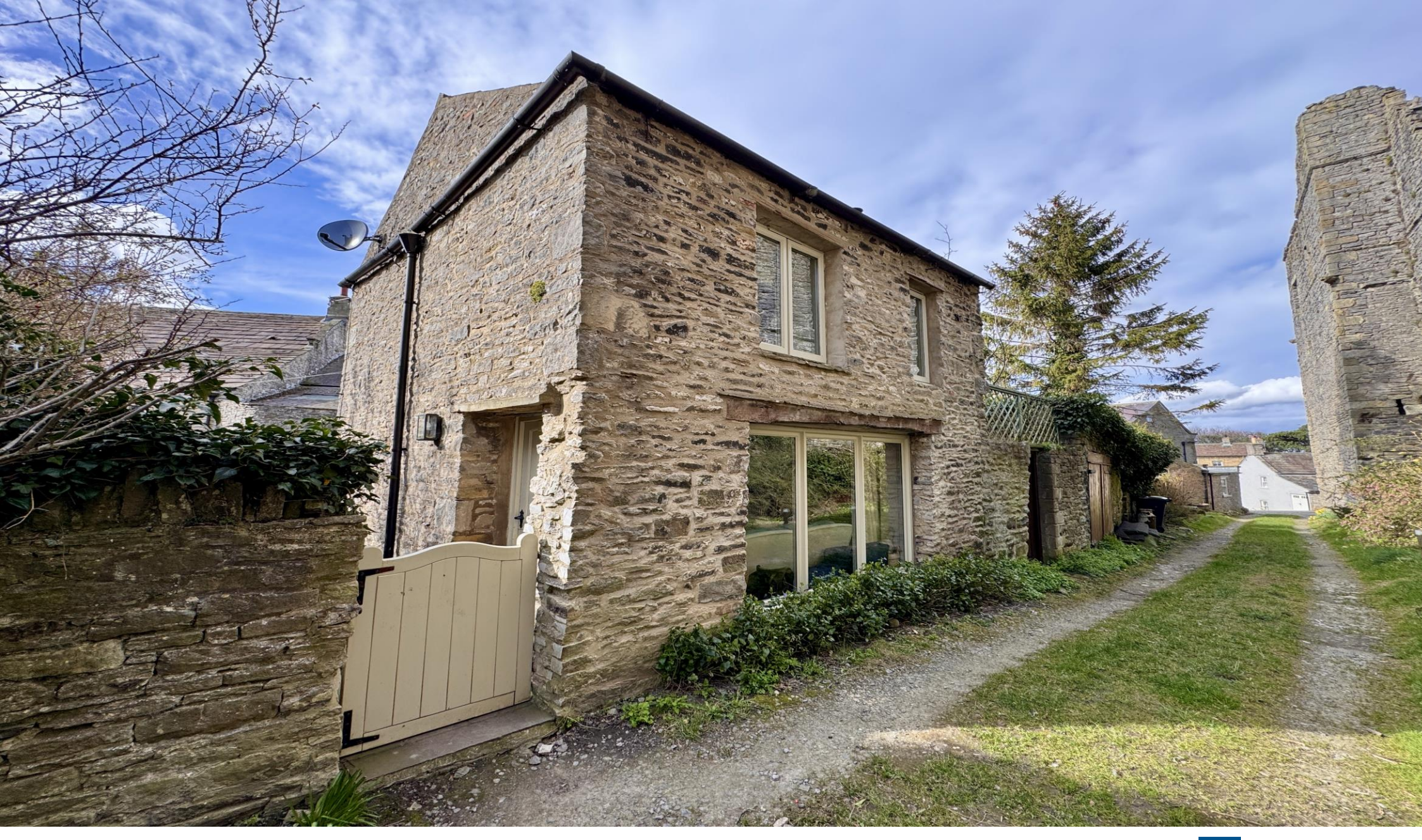
The Coach House

Middleham, Leyburn, North Yorkshire, DL8 4QL