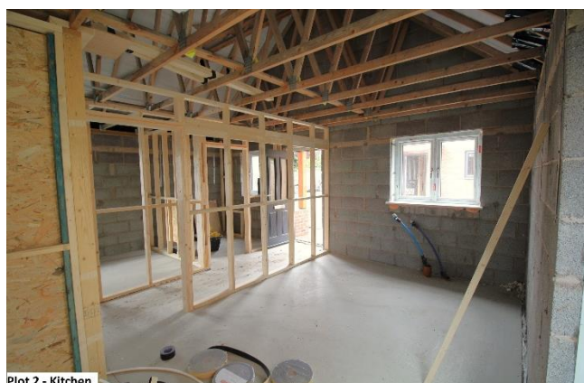
Plot 2 - Kitchen