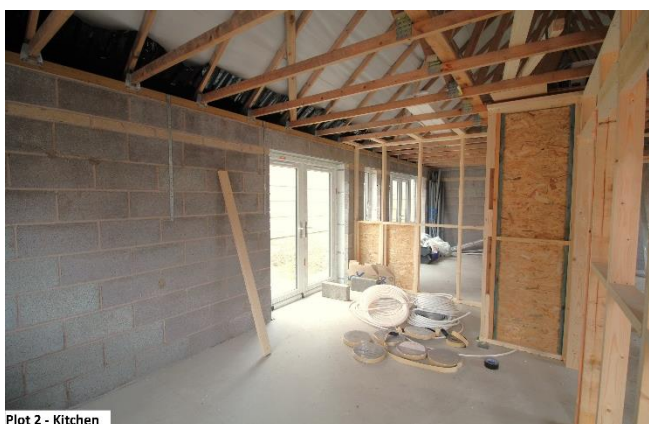
Plot 2 - Kitchen

Bedroom 1: 12' 8" x 10' 2" (3.85m x 3.10m) max