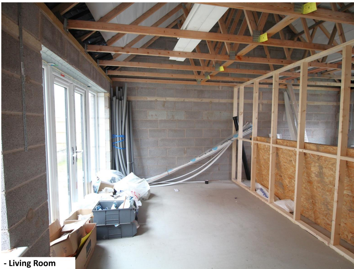
- Living Room