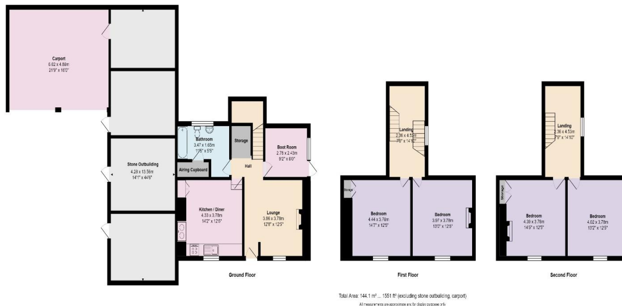
The Chateau, Llawnt, Oswestry, SY10 7PR

We've been working with people to fulfil their property ambitions since 1862. Our heritage is at the heart of the business but we are always looking for ways to innovate so we can provide a service that works for you.