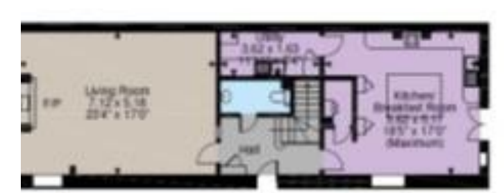
thite Mere Ground Floor