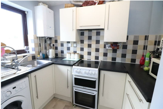
Kitchen 6'4" x 8'7" (1.95m x 2.64m)