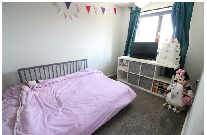
Bedroom Two 10'11" x 7'3" (3.35m x 2.21m)