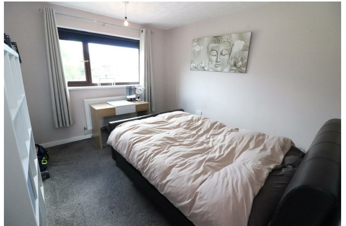
Bedroom Two 10'11" x 7'3" (3.35m x 2.21m)