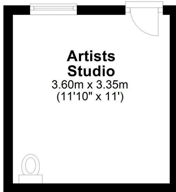
Illustration for identification purposes only; measurements are approximate, not to scale. FP USketch Plan produced using PlanUp.

Approx Gross Internal Area 12.1 sqm / 129.8 sqft