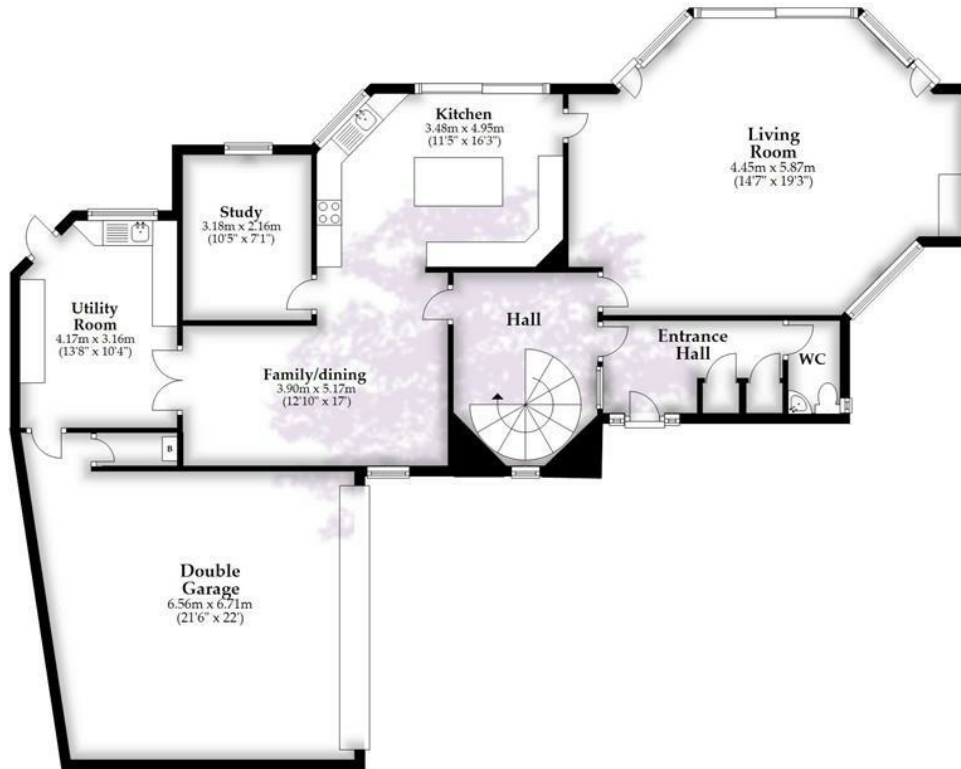
Ground Floor Approx. 153.9 sq. metres (1656.2 sq. feet)