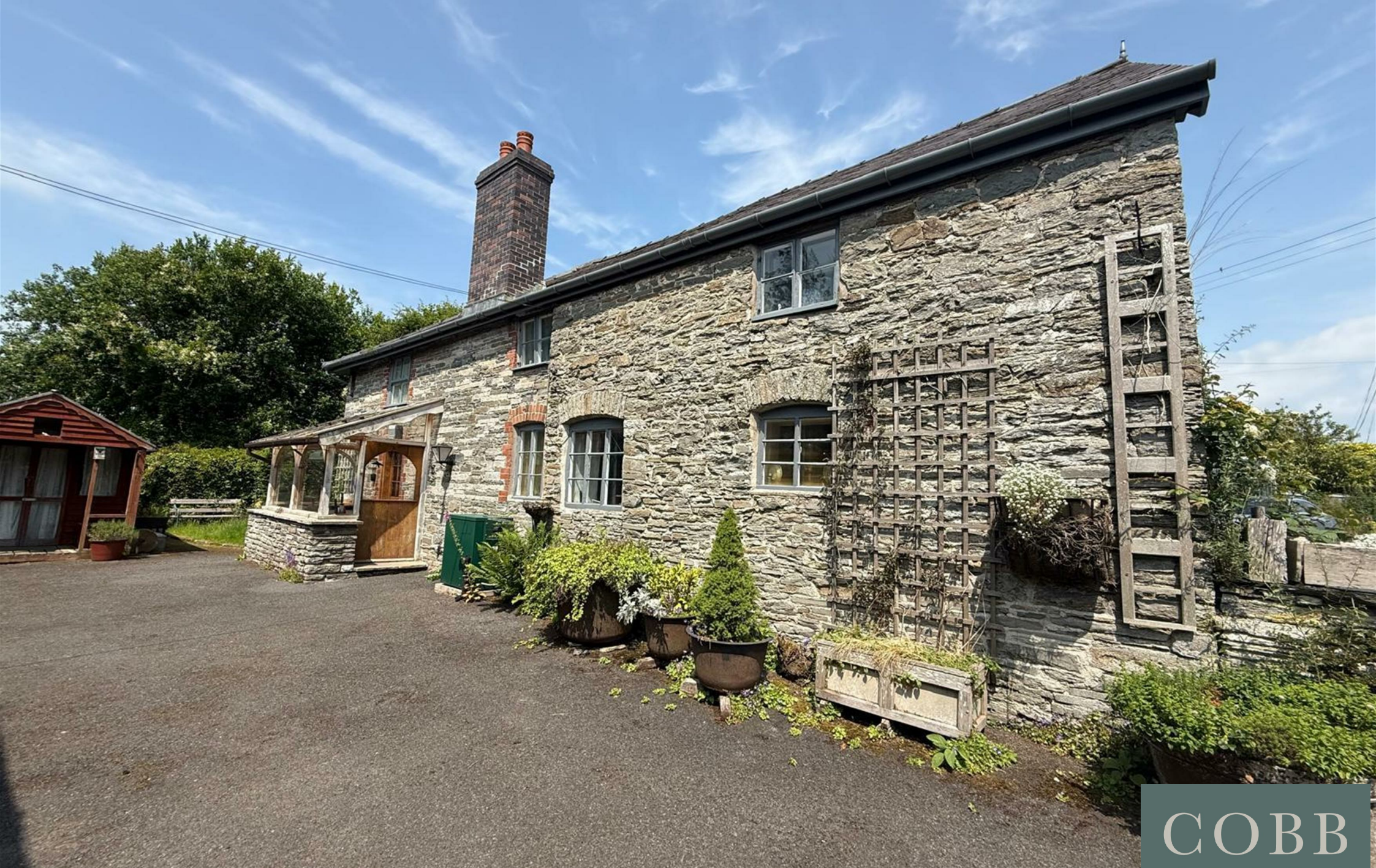
Haines Mill, New Radnor, LD8 2TN Price £505,000