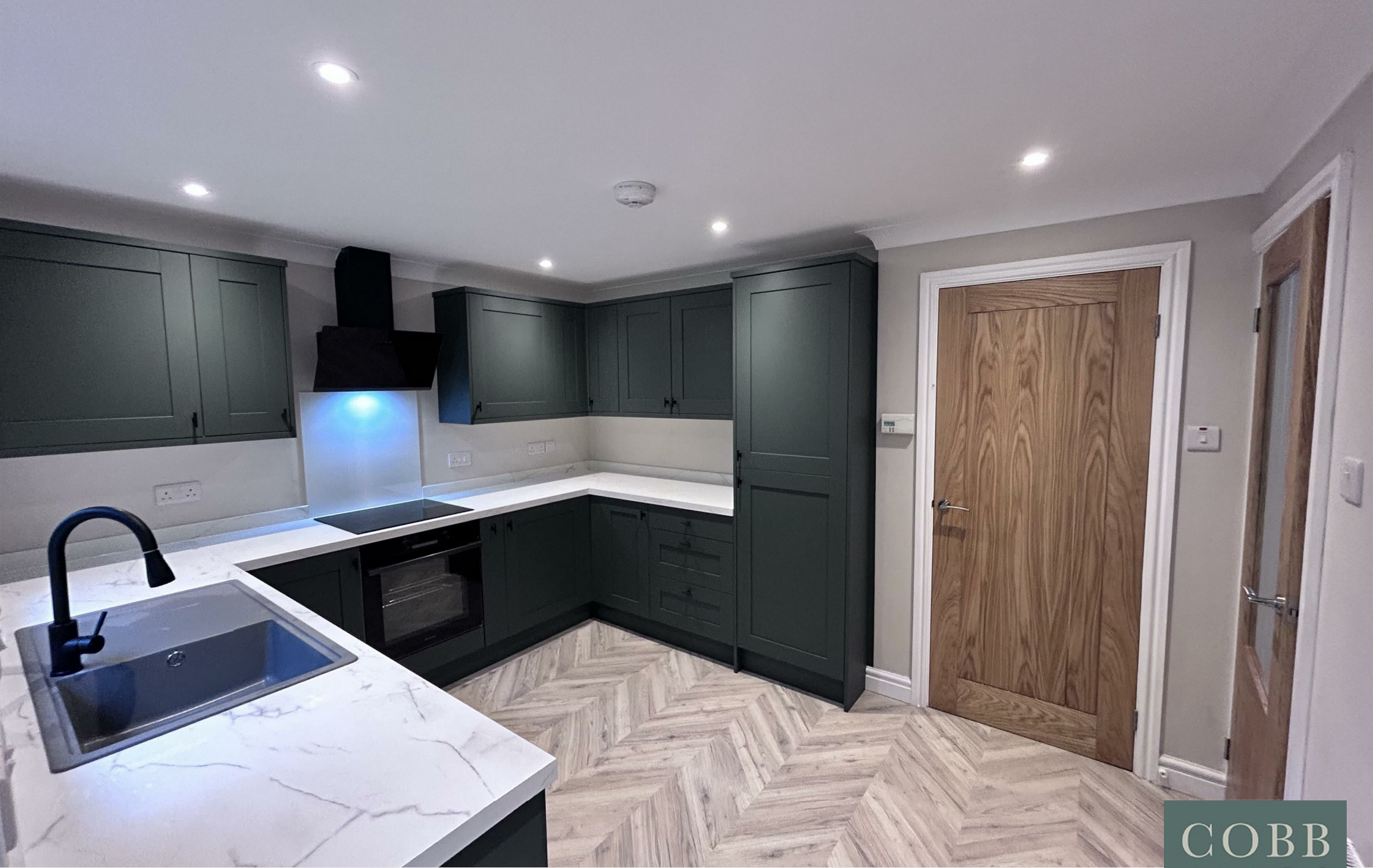
15, Under Ffrydd Wood, Knighton, LD7 1EF Guide Price £260,000