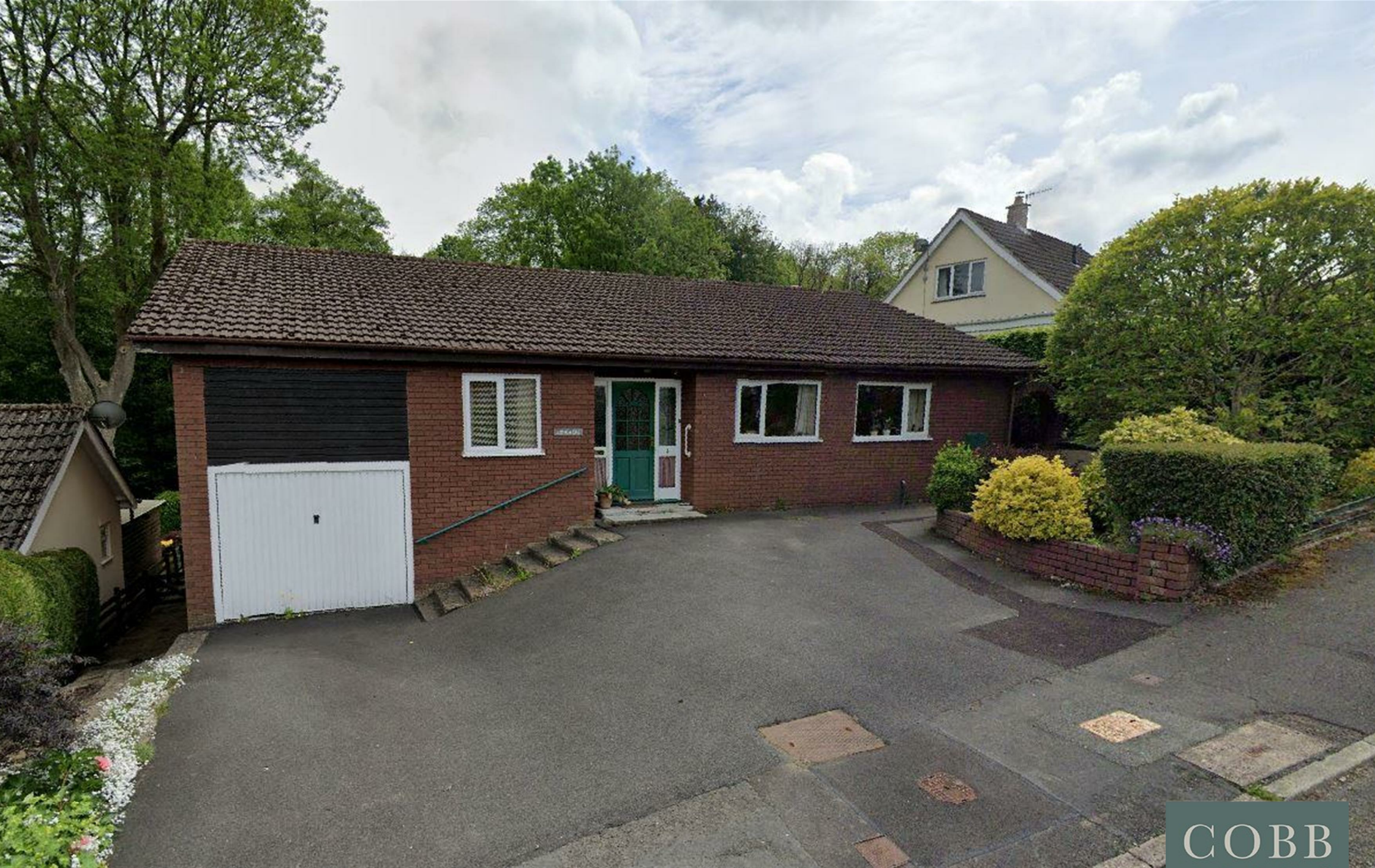
4, The Dingle, Knighton, LD7 1LD Price £350,000