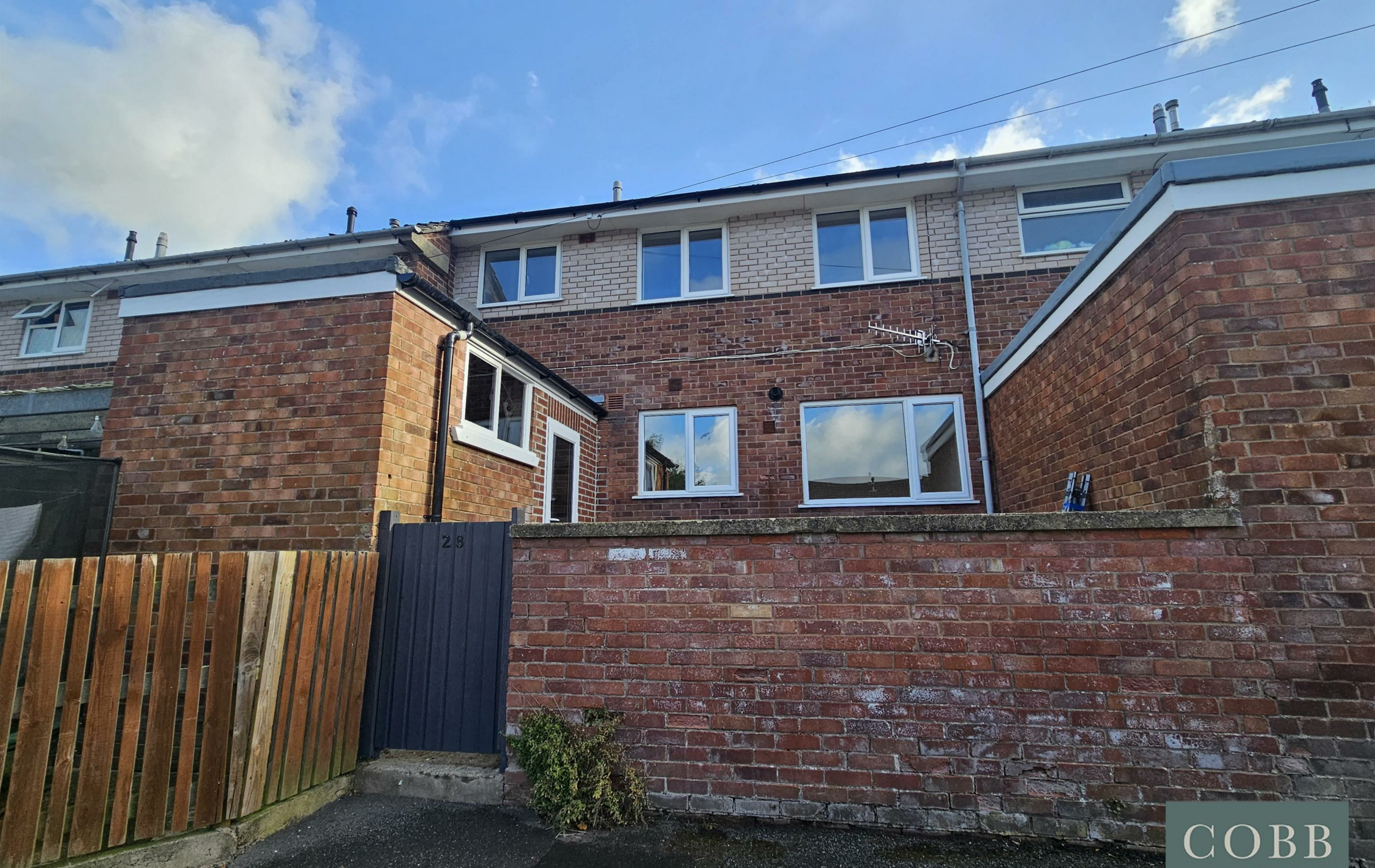
28, Laurels Meadow, Knighton, LD7 1HD Guide Price £125,000