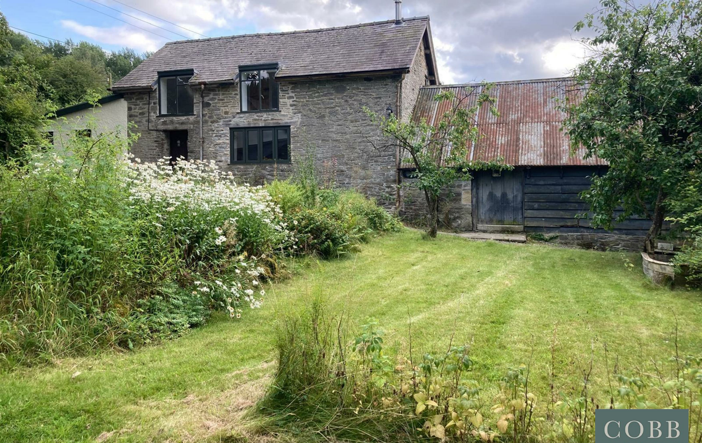
Church House, Dolau, Llandrindod Wells, LD1 5TL Guide Price £265,000