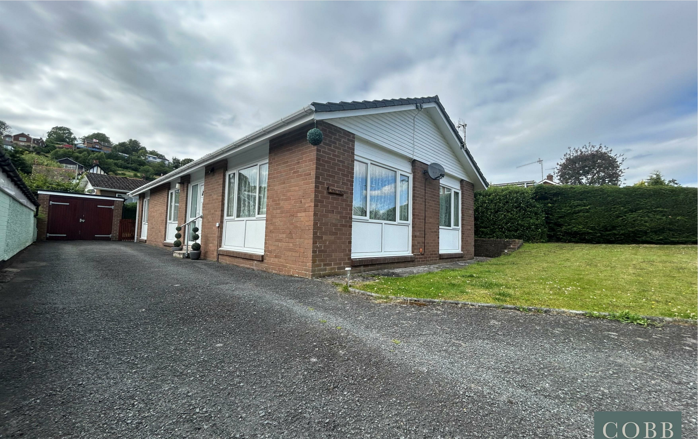
Kintyre, Millfield Close, Knighton, LD7 1HE Price £285,000