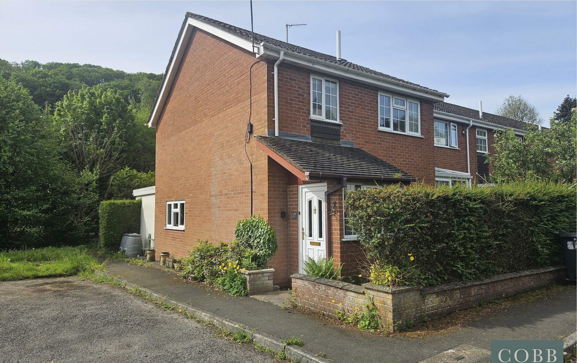
17, George Close, Knighton, LD7 1HL Guide Price £185,000