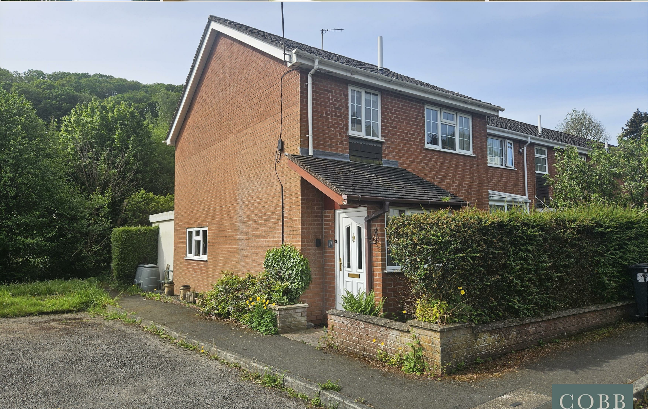
17, George Close, Knighton, LD7 1HL Price £195,000