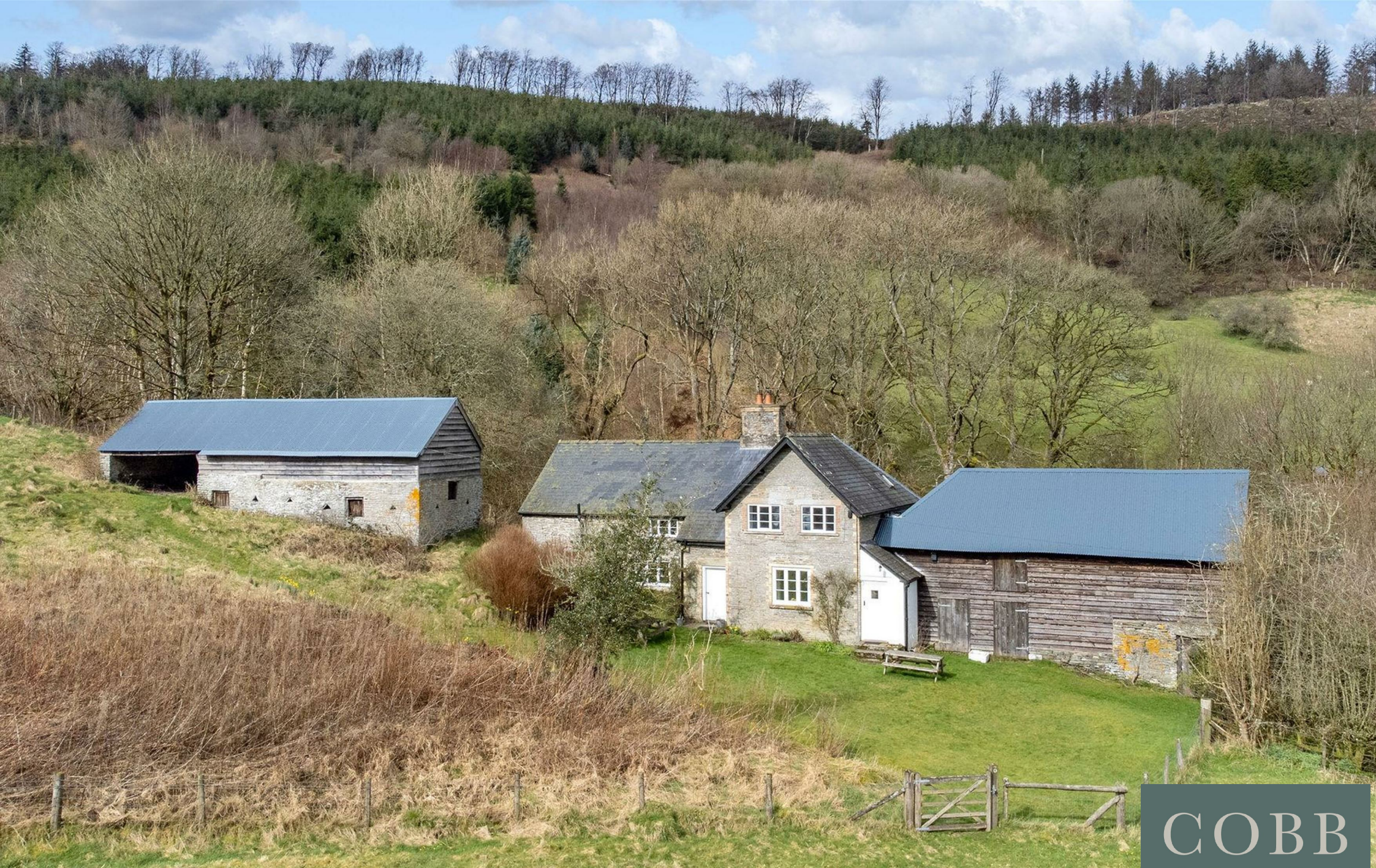
Old Farmhouse & Lodge Cottage, with Appr. 14 acres of land, Bleddfa, LD7 1PB Price £585,000