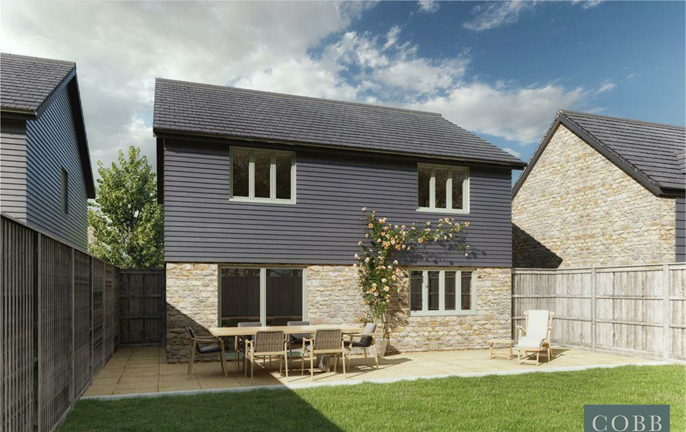
Hollyhock, 6 Cae Bugail, Knighton, LD7 1YG Price £335,000