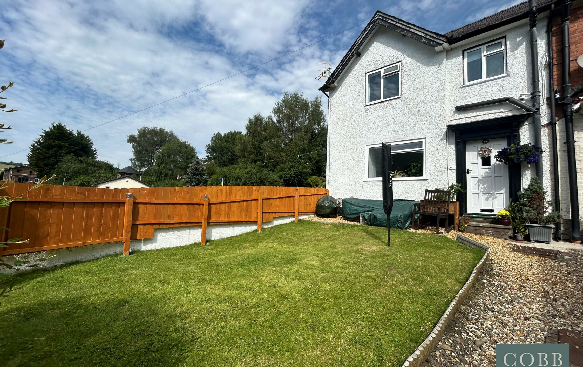
14, Castle Road, Knighton, LD7 1BA Guide Price £215,000