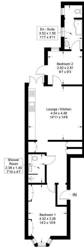
Illustration for identification purposes only, measurements are approximate, not to scale. Fourlabs.co © (ID1264105)

Approximate Gross Internal Area = 63.7 sq m / 686 sq ft