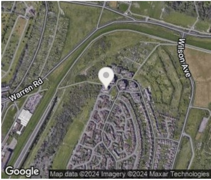
Illustration for identification purposes only, measurements are approximate, not to scale. Imageplansurveys @ 2024