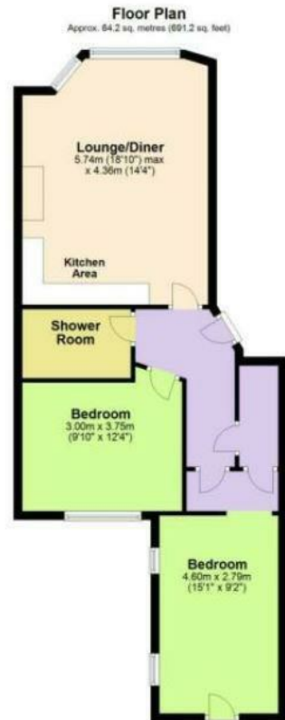
Total area: approx. 64.2 sq. metres (691.2 sq. feet)