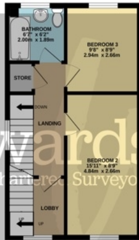
1ST FLOOR 381 sq.ft. (35.4 sq.m.) approx.