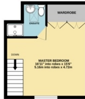
2ND FLOOR 244 sq.ft. (22.6 sq.m.) approx.