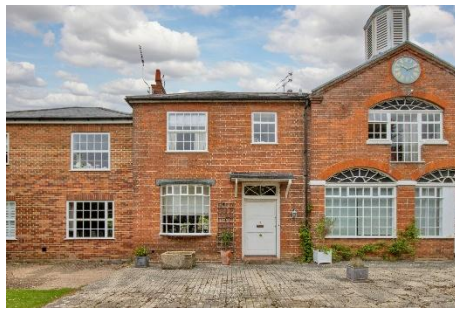
3 RISDEN CLOCK HOUSE