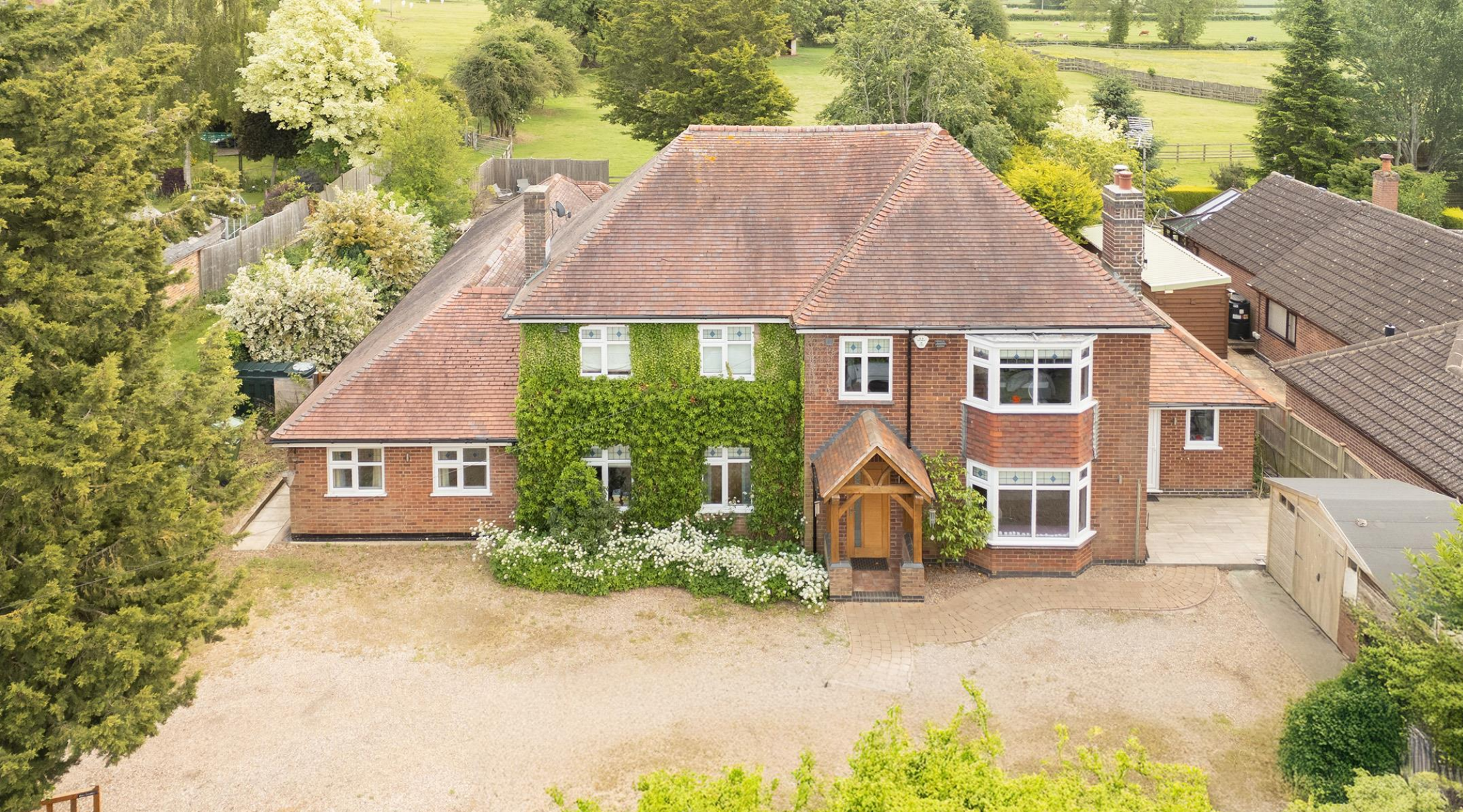
Ravendale House, Fir Tree Lane, Swinford, Lutterworth, Leicestershire, LE17 6BH