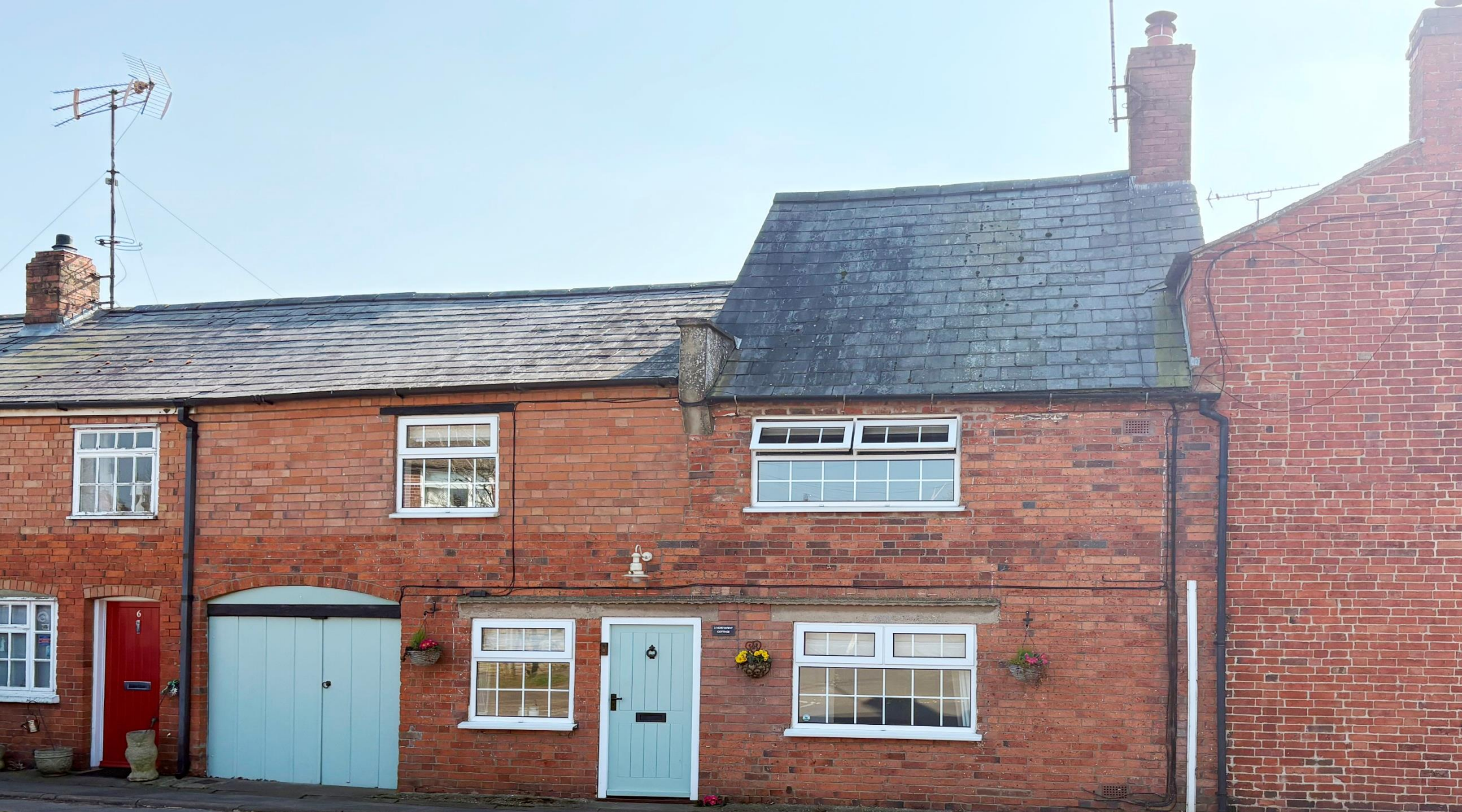
2 Northview Cottages, North Street, Swinford, Lutterworth Leicestershire, LE17 6BE