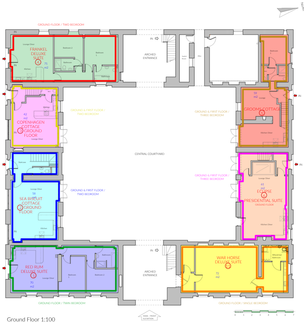
Ground Floor 1:100