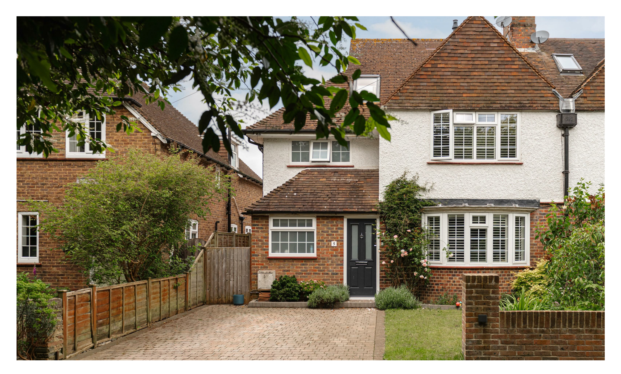
East Walk, Reigate