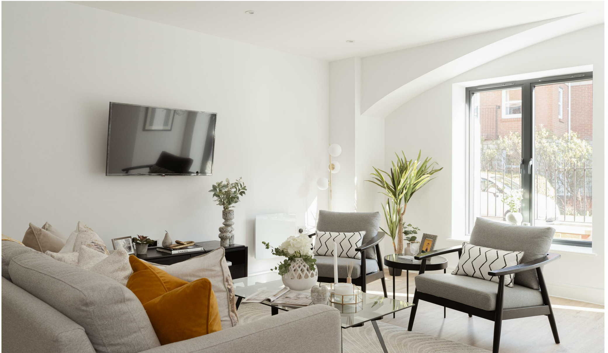
Roebuck Close, Reigate £325,000