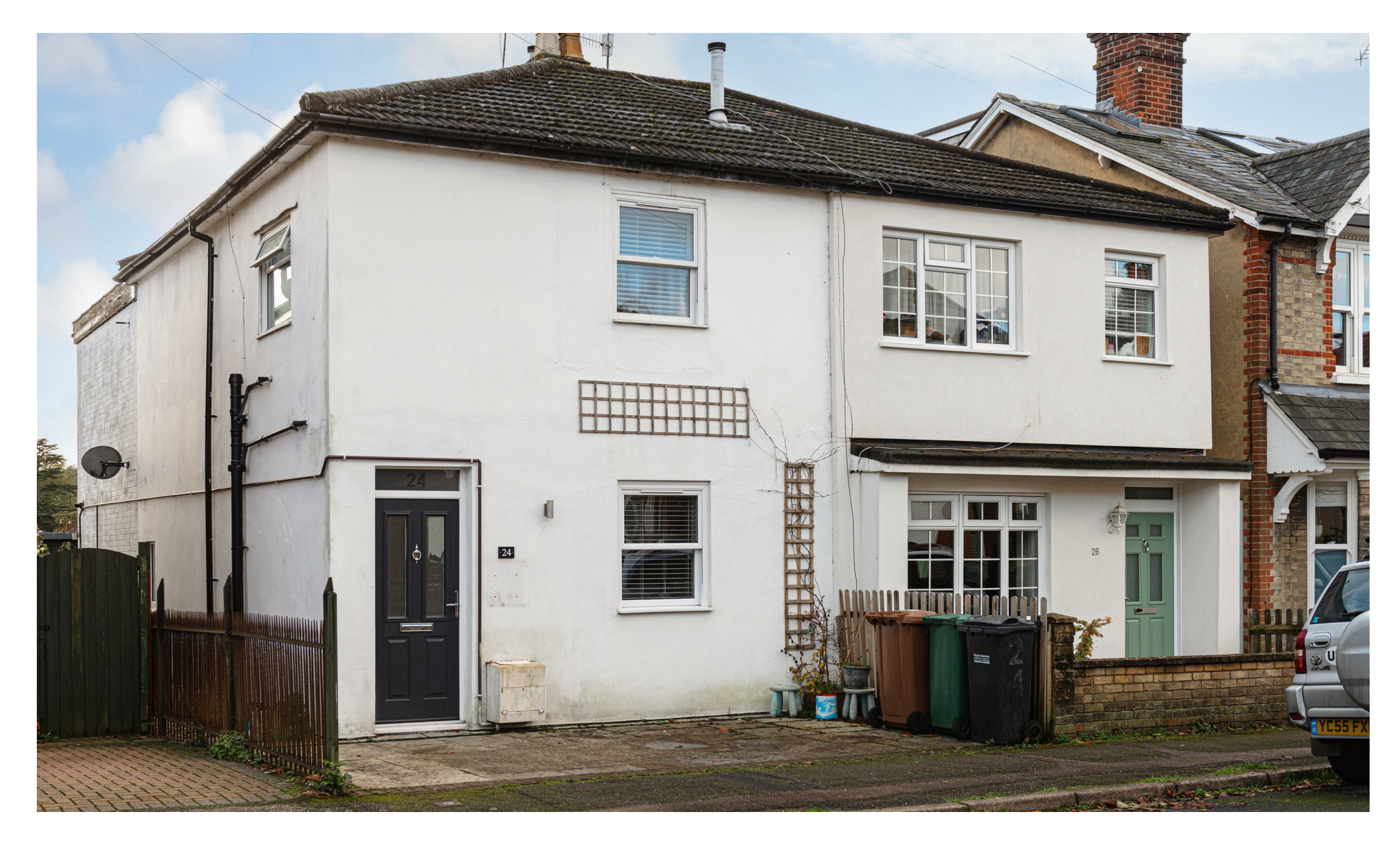
South Albert Road, Reigate