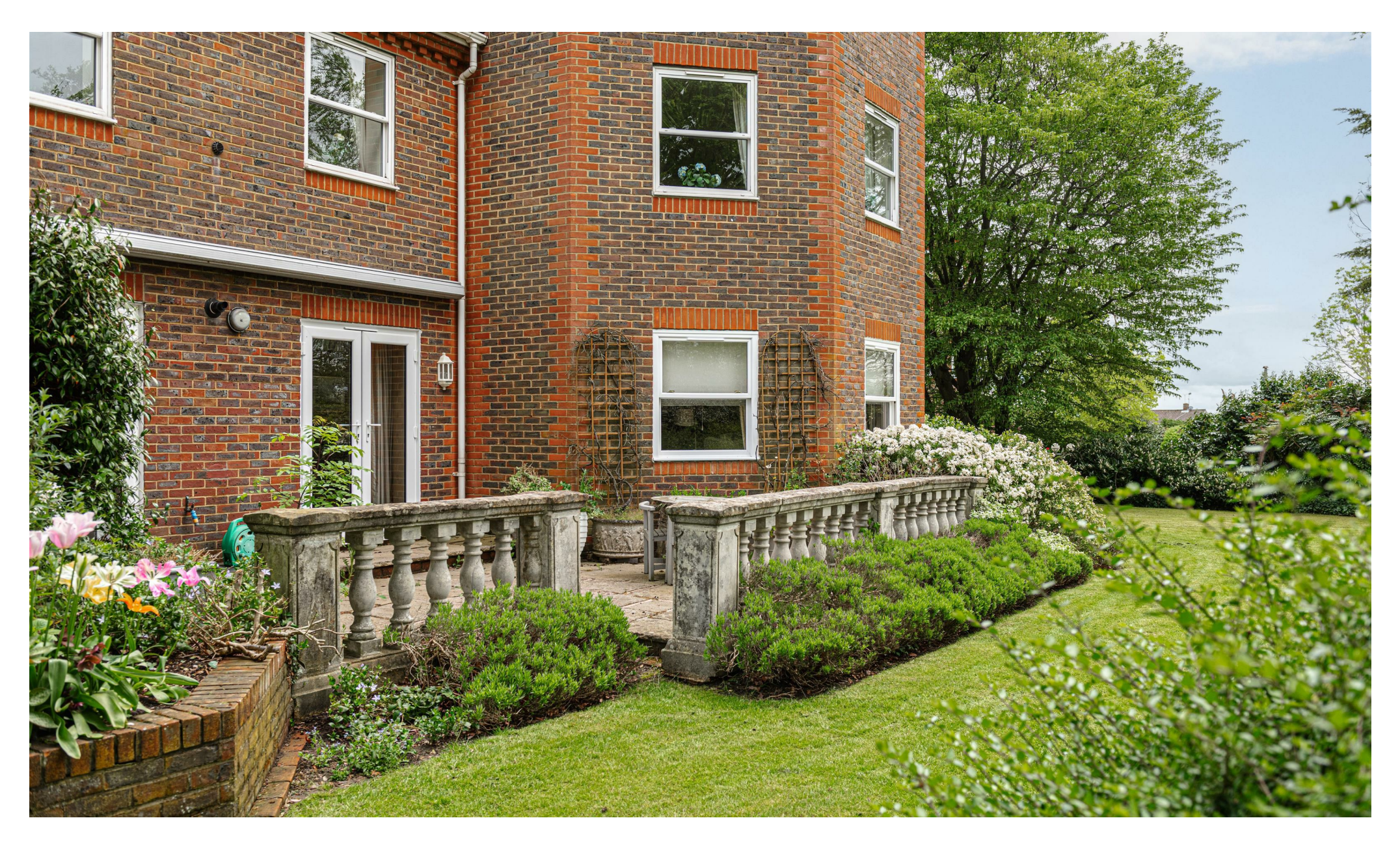
Batts Hill, Reigate £675,000