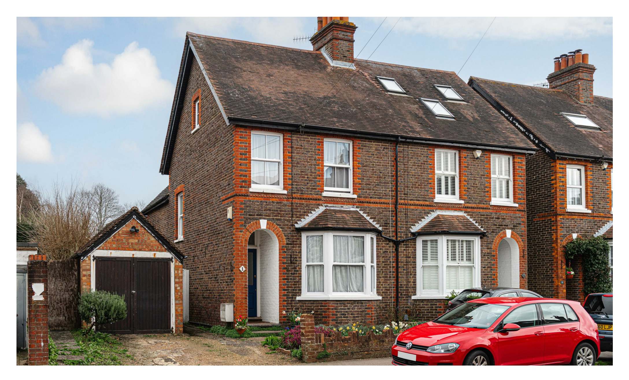
Deerings Road, Reigate