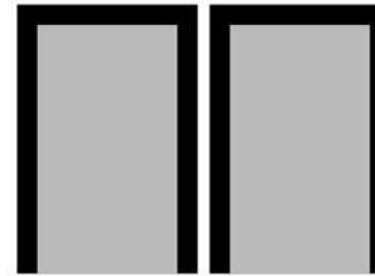
Two Allocated Parking Spaces (One Covered)