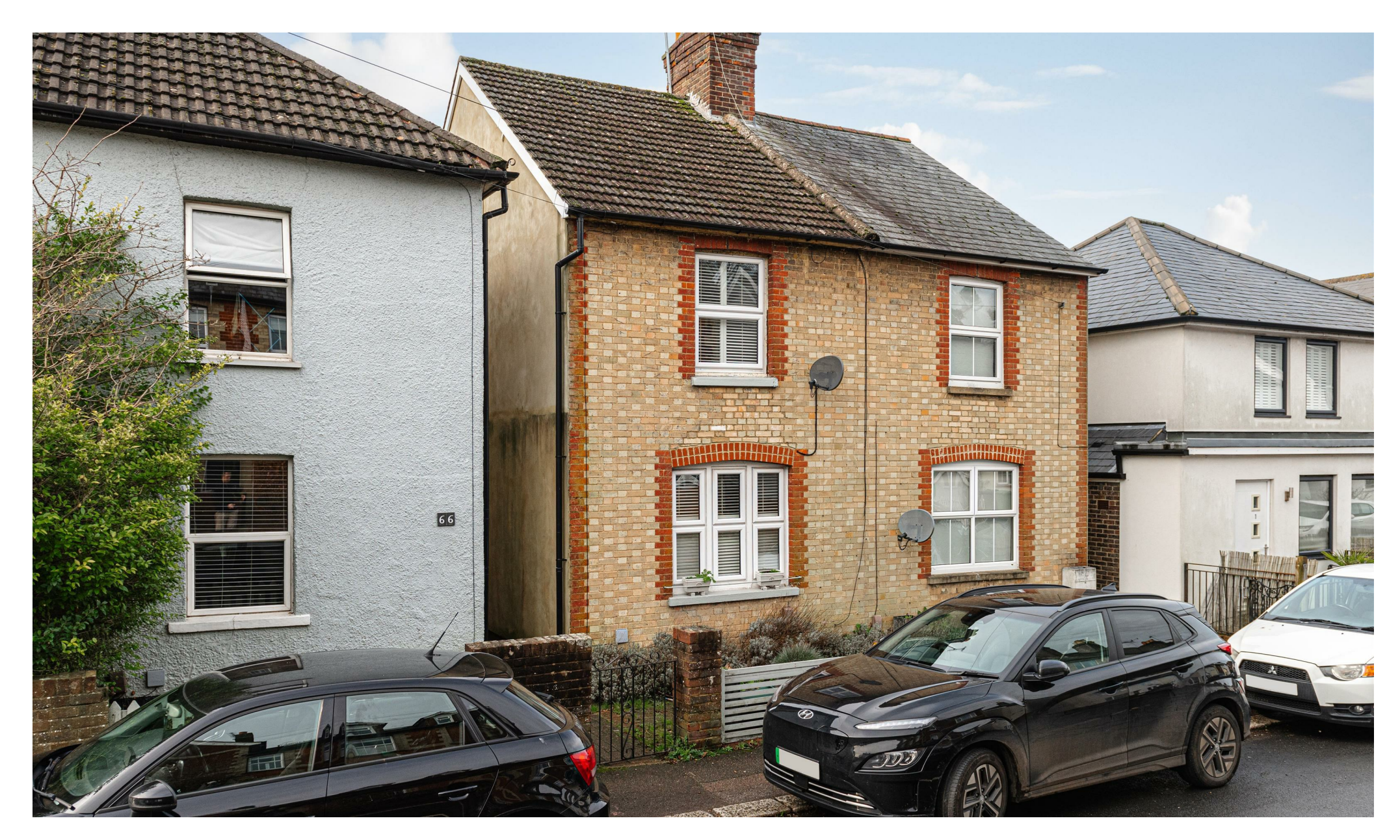
Priory Road, Reigate £500,000