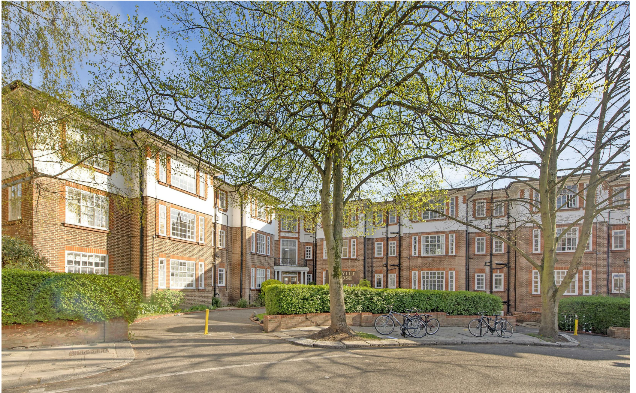
Howitt Close NW3