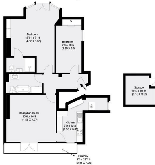
Raised Ground Floor

THIS FLOOR PLAN IS PRODUCED FOR PARKHEATH SUBMITTED BY ARCHIMEDIA web: www.archi-media.co.uk