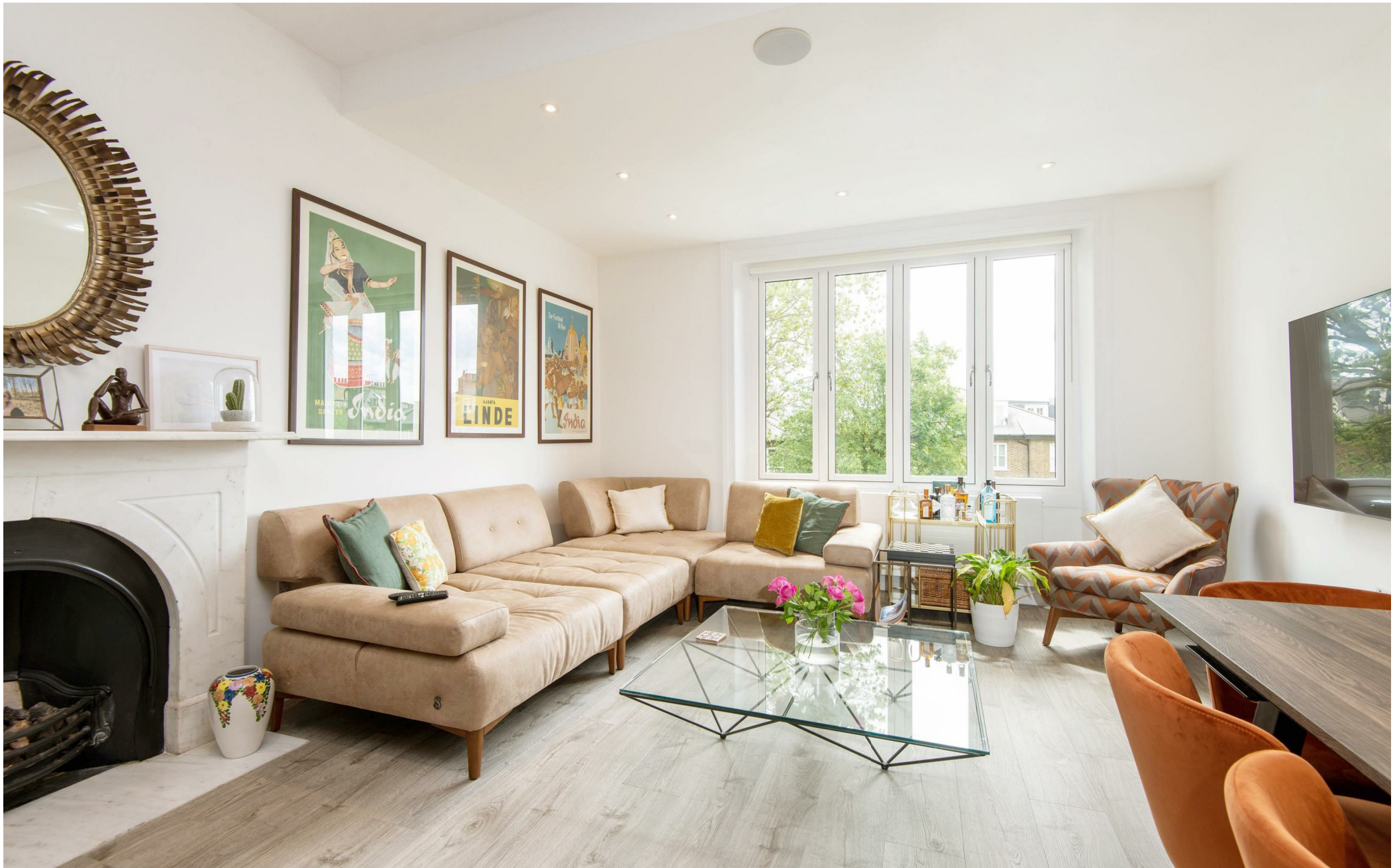
Belsize Park Gardens NW3