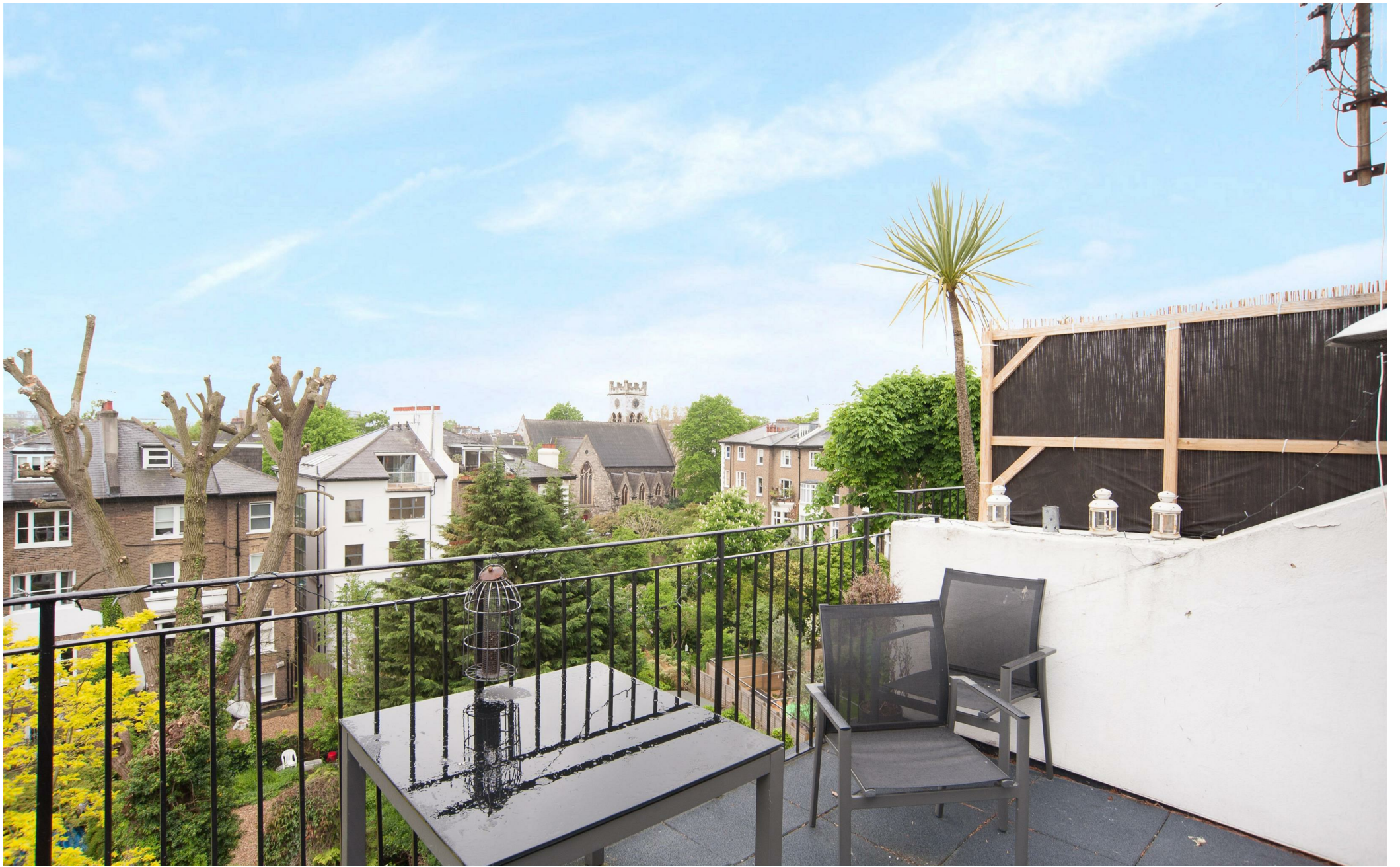
Belsize Park Gardens NW3