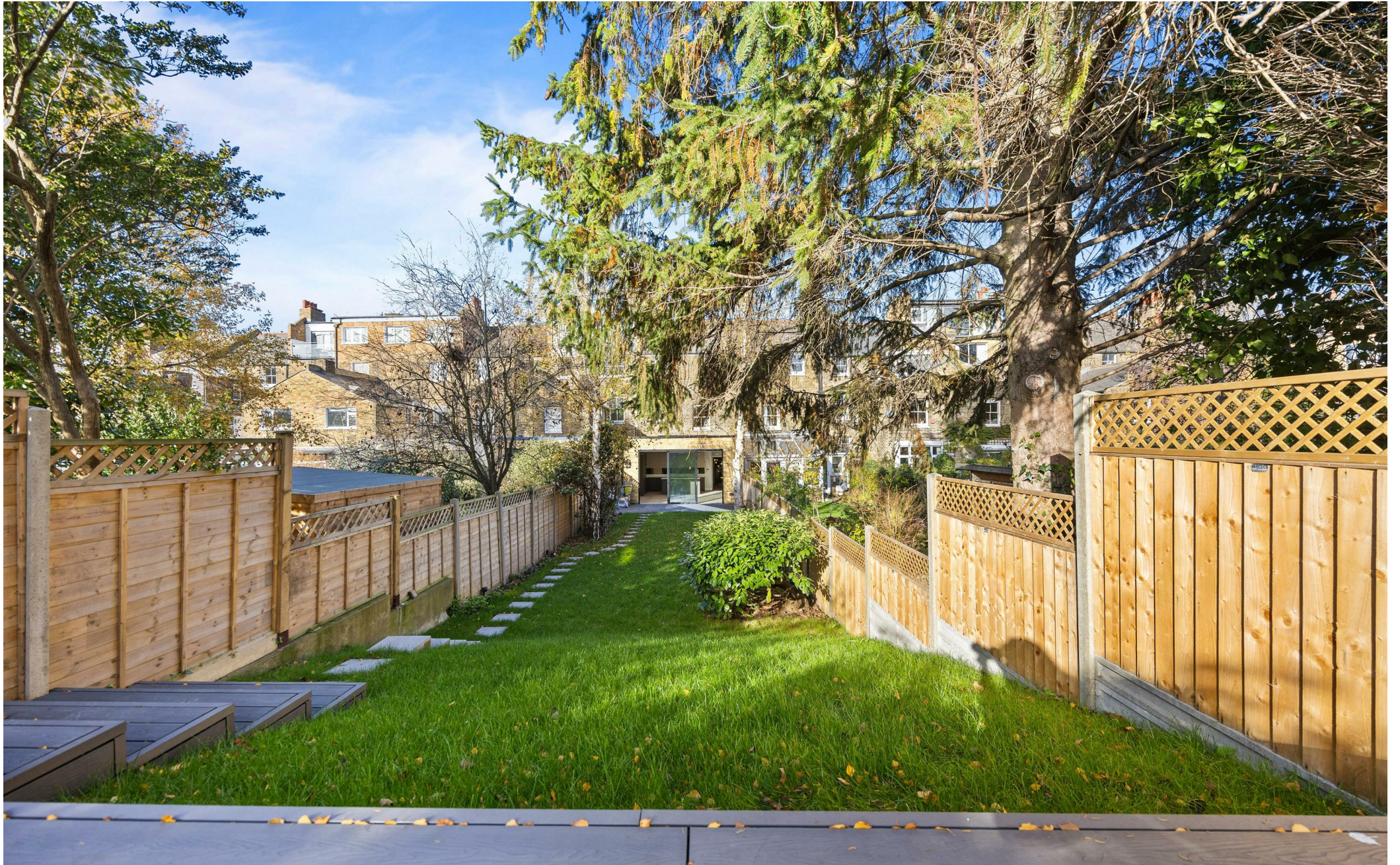
Gondar Gardens NW6