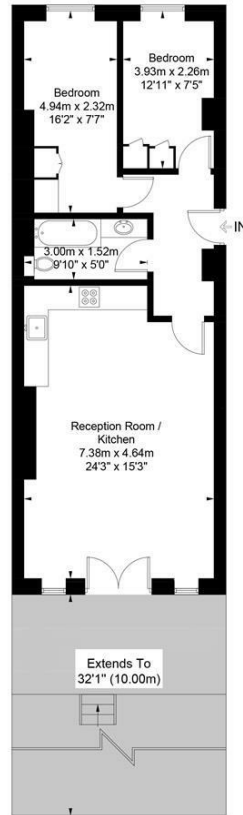
Illustration for identification purposes only, measurements are approximate, not to scale. FloorplansUsketch.com © 2017 (ID373638) ELLIE CLAIRE PHOTOGRAPHY LTD